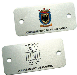
Aluminum plate 74 x 35 mm.

Recommended anchoring: by means of M10 expansion bolts depending on the surface and the project.