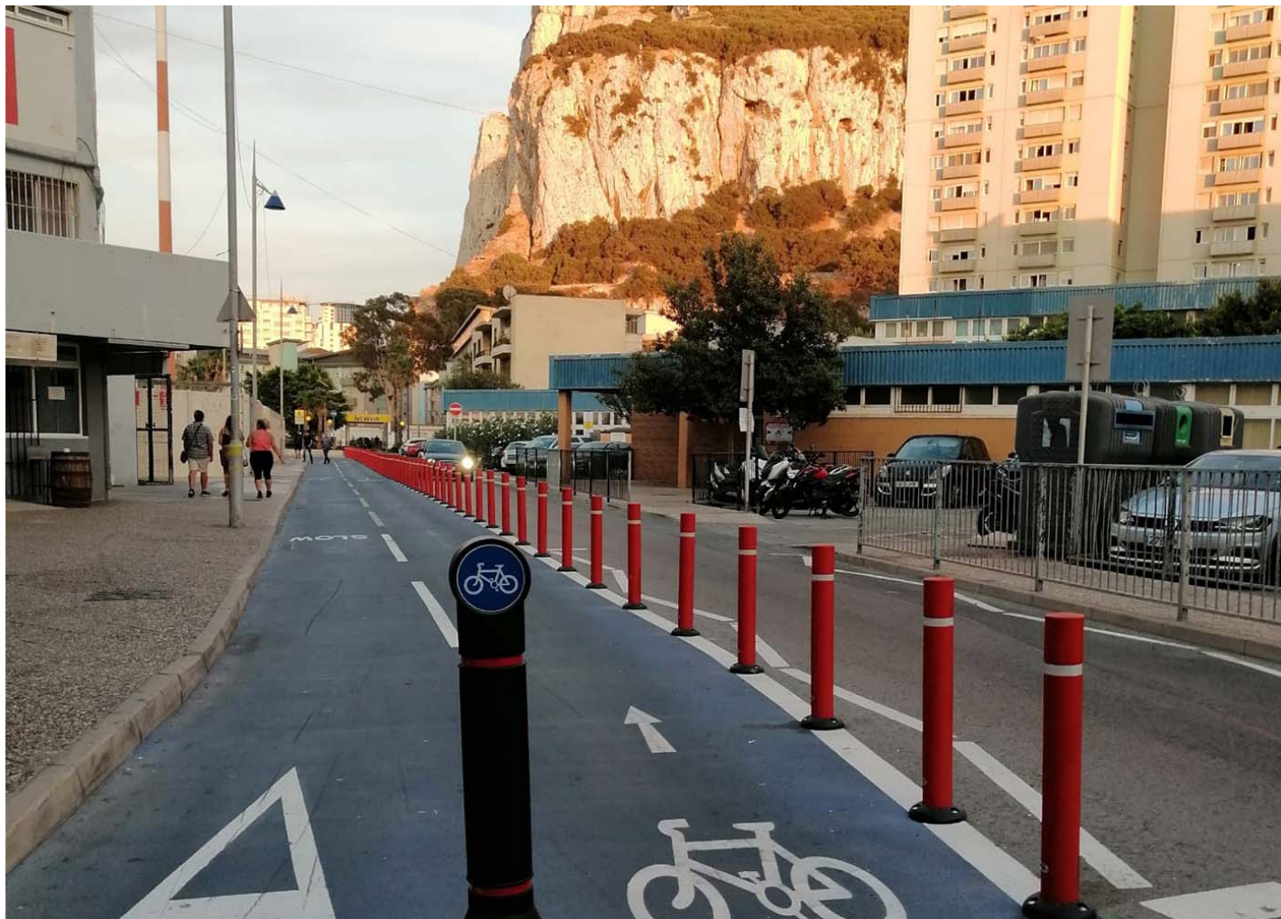
Flexible with Base Plate HFLEXP

Gibraltar protects its cycle lanes with flexible bollards with a base for greater safety