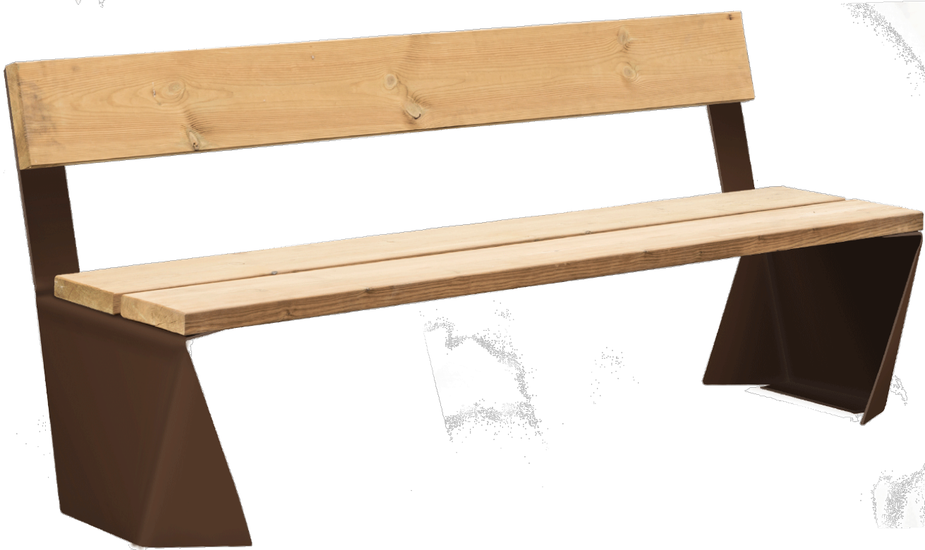
Bench made of pine wood. Galvanised steel legs. Stainless steel screws.