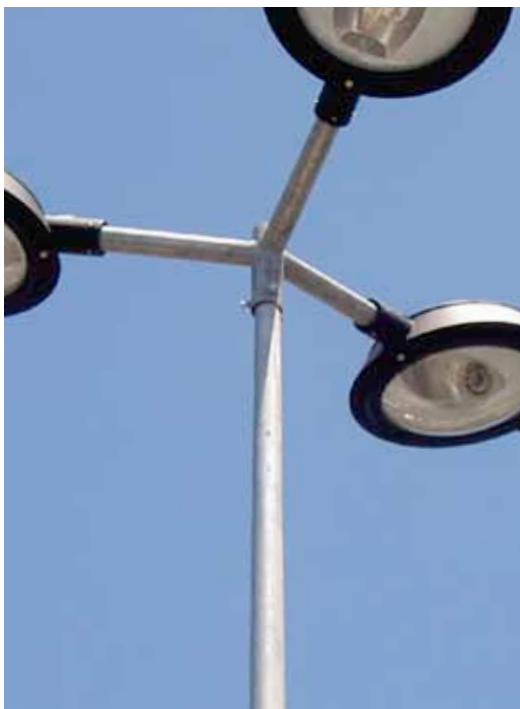
Acero S-235-JR galvanizado Acier S-235-JR galvanisé. Steel S-235-JR galvanized.