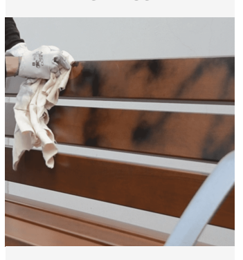
Protector for materials from paints, graffiti ....