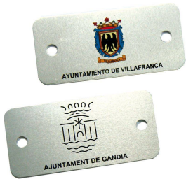
Aluminium plate 74 x 35 mm.