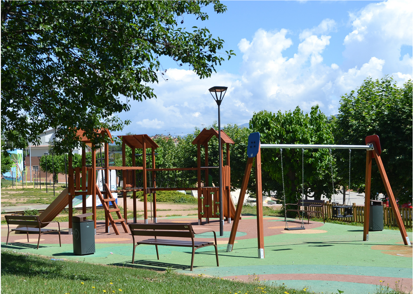
MADERA 2 Flat JL1520000

In Sant Hipòlit de Voltregà, Barcelona, a complete children's playground awaits the little ones. Equipped with games, lighting, and Benito urban furniture, it's the ideal place for fun and family gatherings.