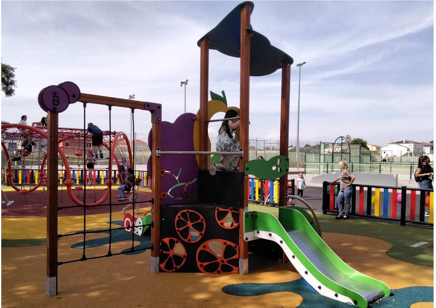
METALICA DE COLORES VVP034

Inauguration of the new playground area of Pinet, thus meeting one of the most frequent demands of the inhabitants of the area.