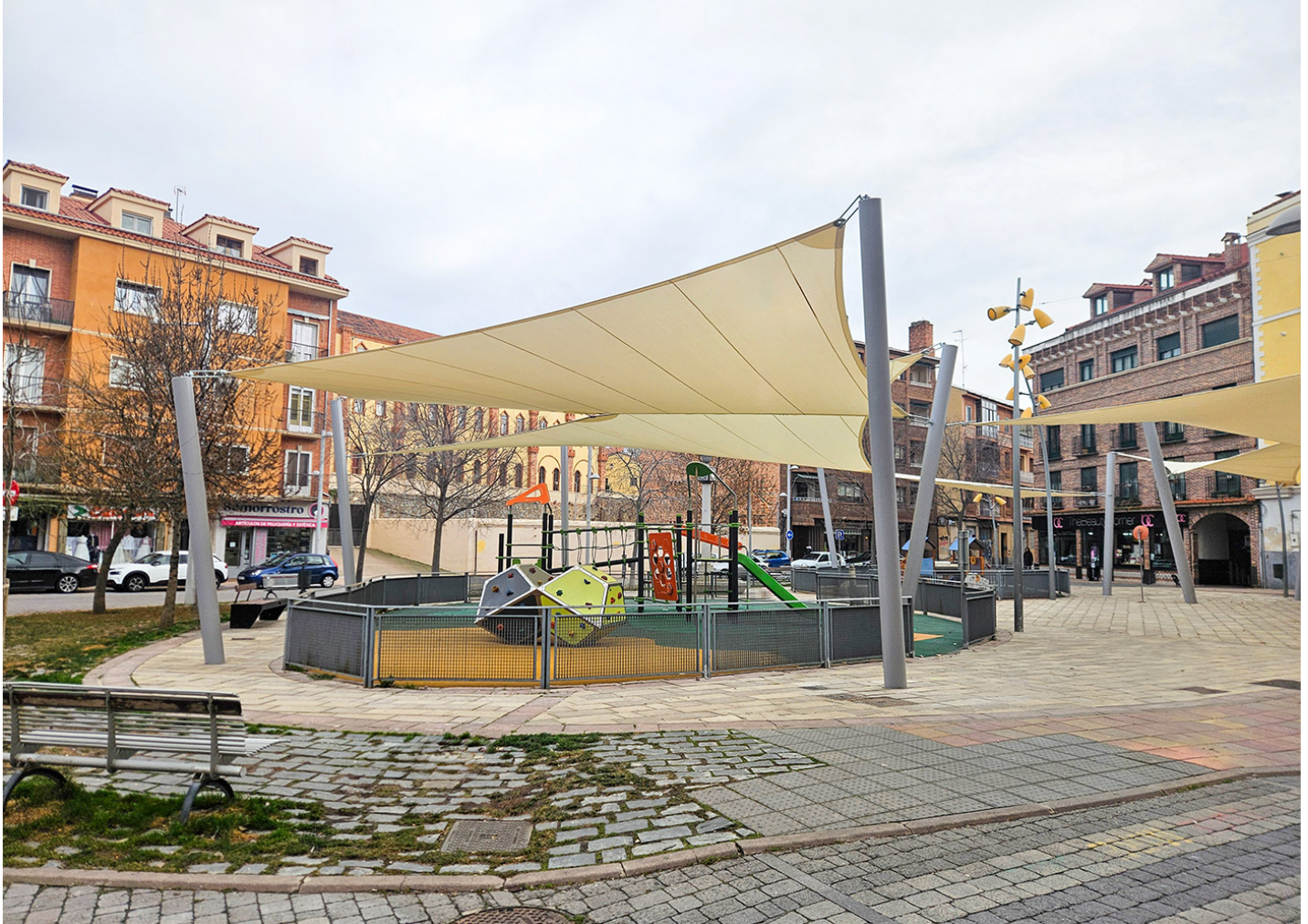
DOUBLE SQUARE 128m2 JGV128Q

Geovelas, both square and triangular, have been installed in Plaza de Somorrotro in Segovia to provide greater protection during the summer to the Berna children's playground.