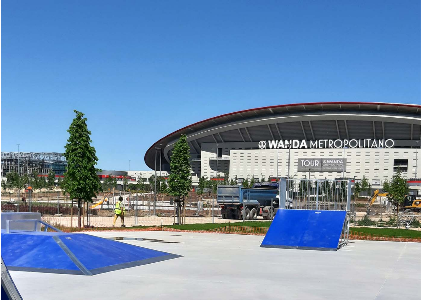
Bank 125 JSK1006-K

The neighbours of the Atlético de Madrid stadium, in the district of San Blas-Canillejas, benefit from a skate park by BENITO as well as areas for rest and leisure.