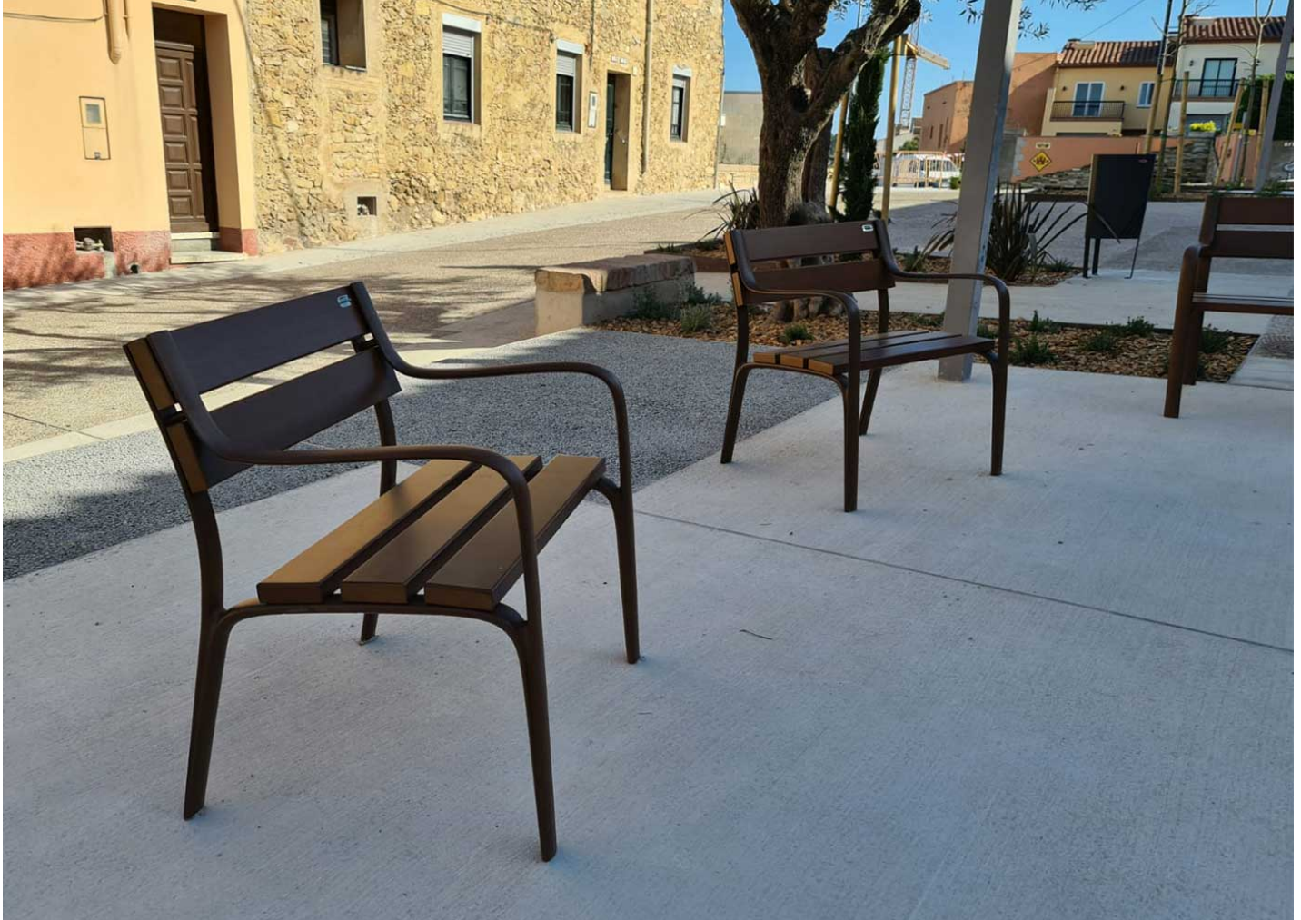
Argo 80 PA613

Installation of Citizen benches and chairs made of wood and cast iron in the municipality of Llers in the province of Girona.