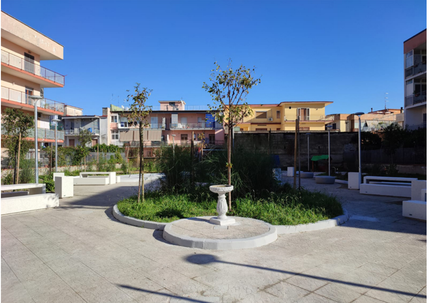
Citizen Clear ILCZ

Casavatore, a municipality located in the Metropolitan City of Naples, has opted for BENITO products.