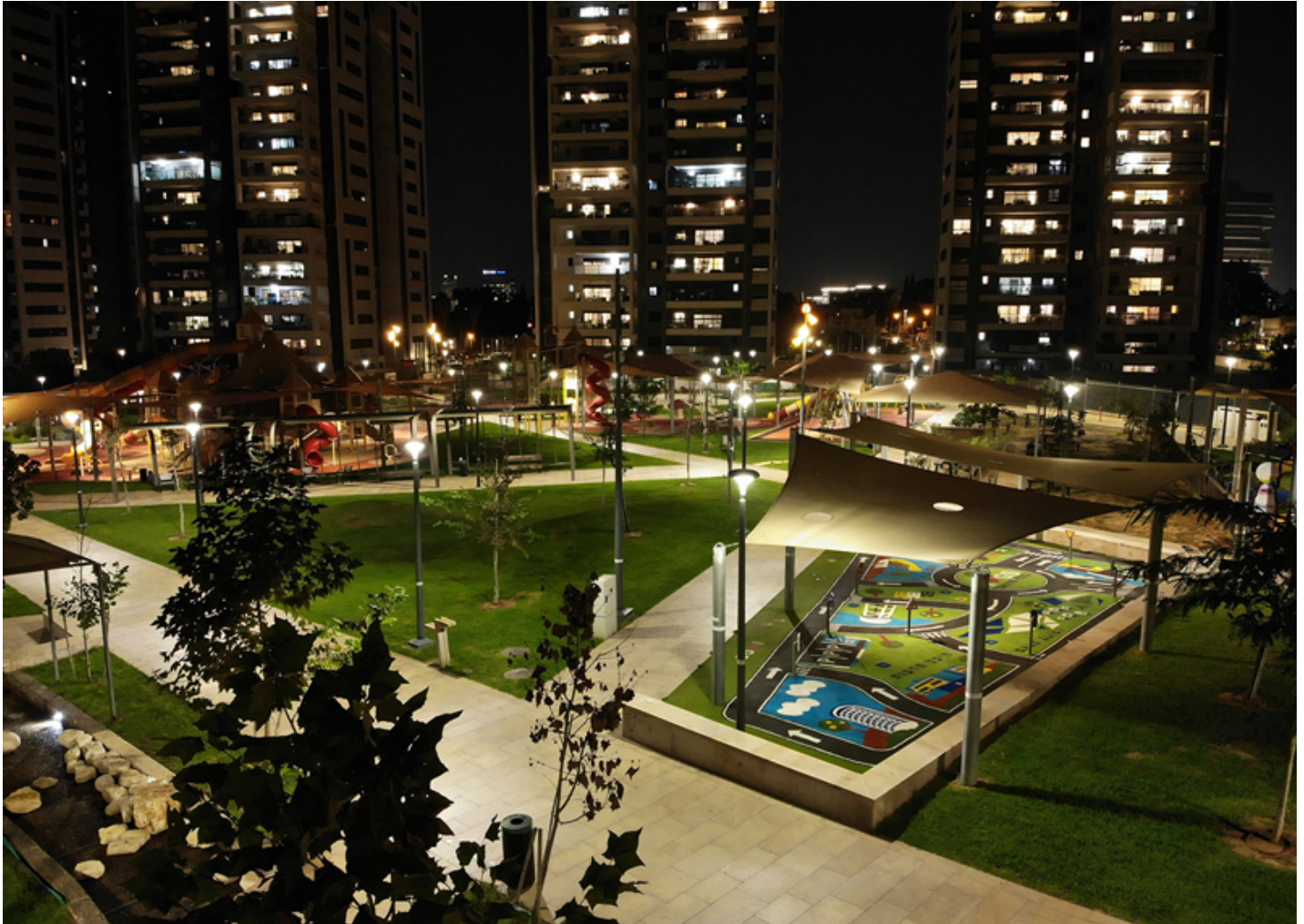
Citizen Clear ILCZ

New CITIZEN LED technology luminaires in Giva't Shmu'el, Israel, with the aim of improving energy efficiency and the quality of lighting by providing more uniform and sharp illumination in the area.