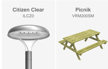
Mall of Arabia

The constant improvement and evolution of our products may result in some modifications of the technical specifications and characteristics of the products without prior notice.