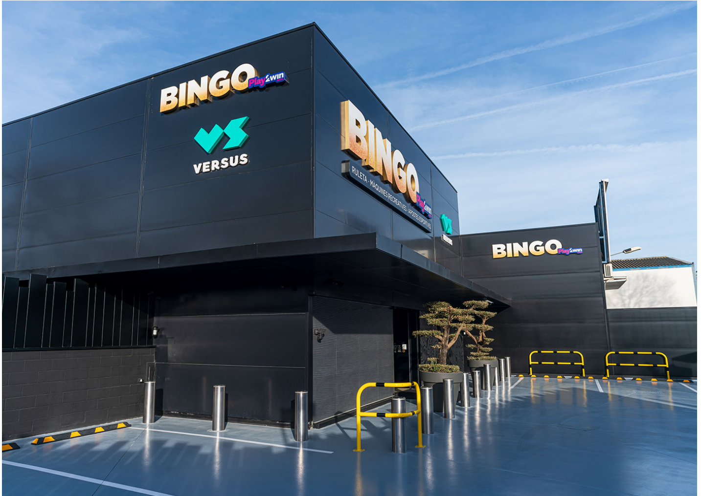
Embedded Fixed Ø220 HE220 Semi-Automatic Telescopic with key Ø220 x 500mm H2208

Installation of fixed bollards (HE220L) and semi-automatic bollards (H2208H75L) with LED light crowns at the Reus Casino, the most effective solution for access control and prevention of ram-raiding.