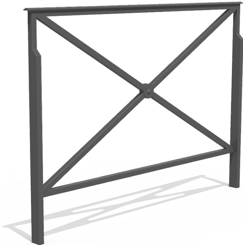
St André Removable VVBA164M-1