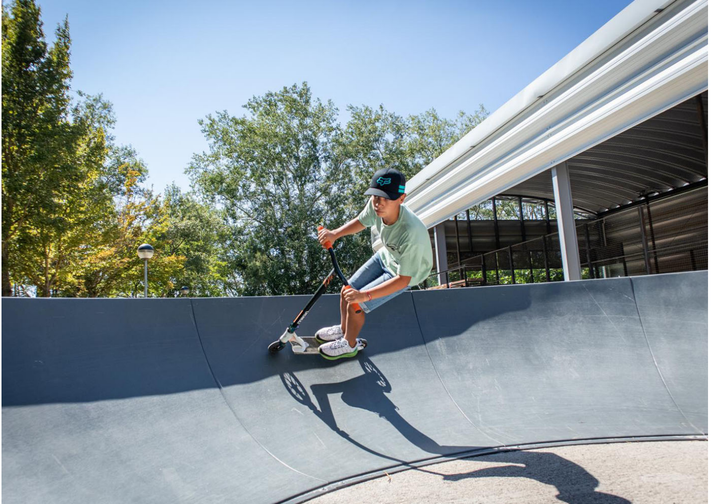
Pump Track 41mL JPT050

Installation of a 41 m 2 Pumptrack in the province of Cuenca: a safe space designed to learn and enjoy on bikes and scooters.