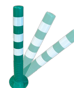
Flexible Blanda H476V