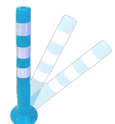
Flexible Blanda H476AZ