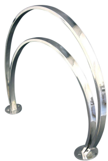
Bike Rack in stainless steel (VBO11).

The Ferrus treatment consists of three layers that are applied after cleaning all dirt and impurities by shot blasting and consists of an electrolytic bath, followed by a layer of epoxy primer and a final coating of polyester powder paint in grey RAL 9006. Recommended anchoring: By means of 4 M8 expansion bolts, depending on the surface and project.