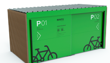
10 PLAZAS SECUR LUX VBS10M