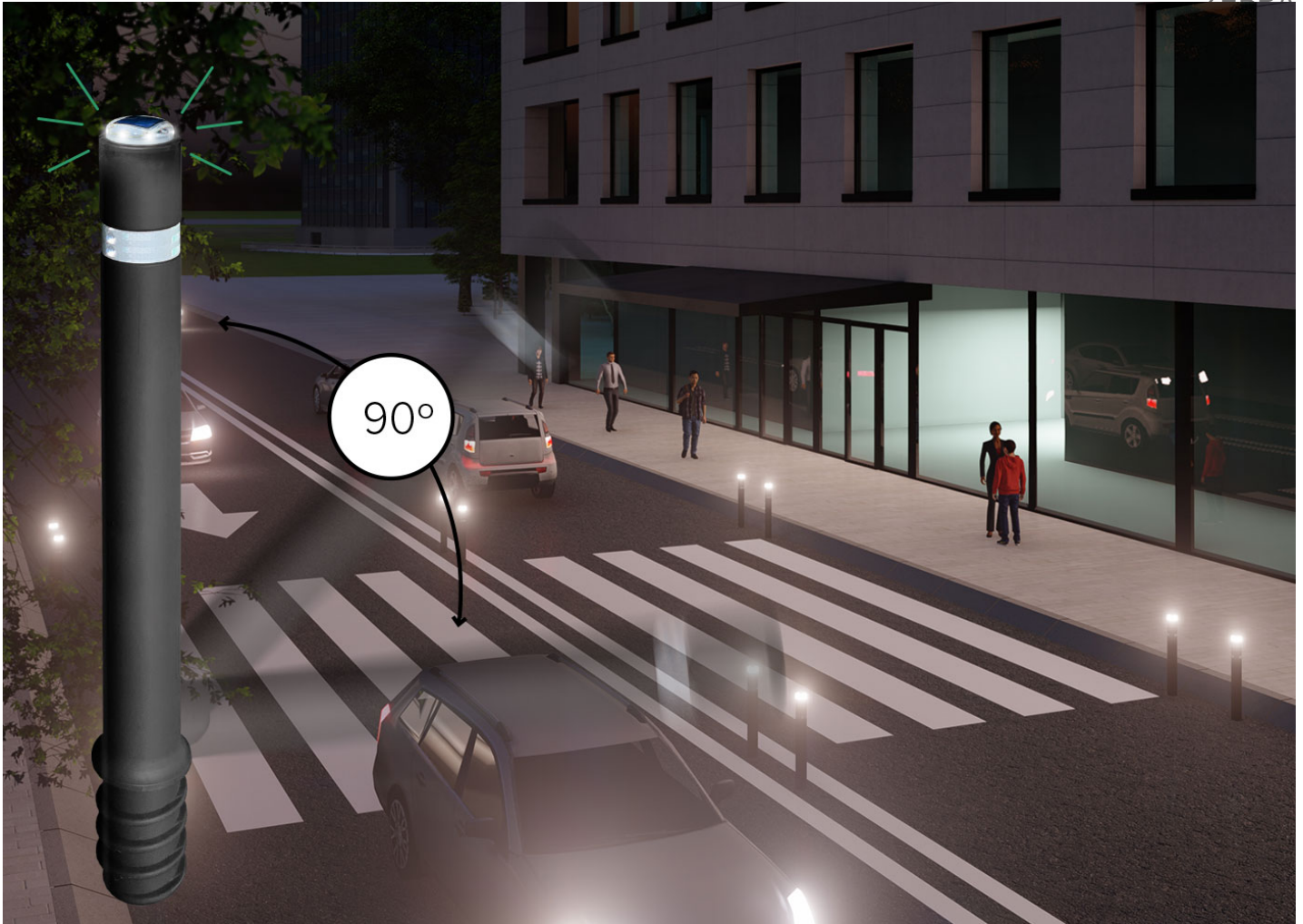
high-security anti-run over, LED lighting ZEBRAPLUS