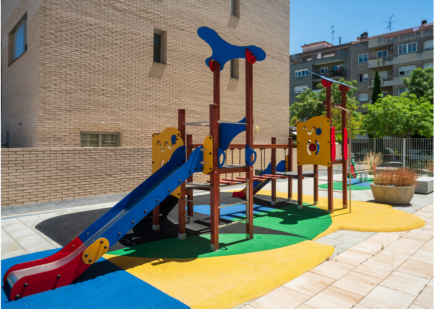
MADERA 1 Nest JL1500010

In a residential area of Vilafranca del Penedès (Barcelona), a completely new play area has been created with children's play equipment and urban furniture.